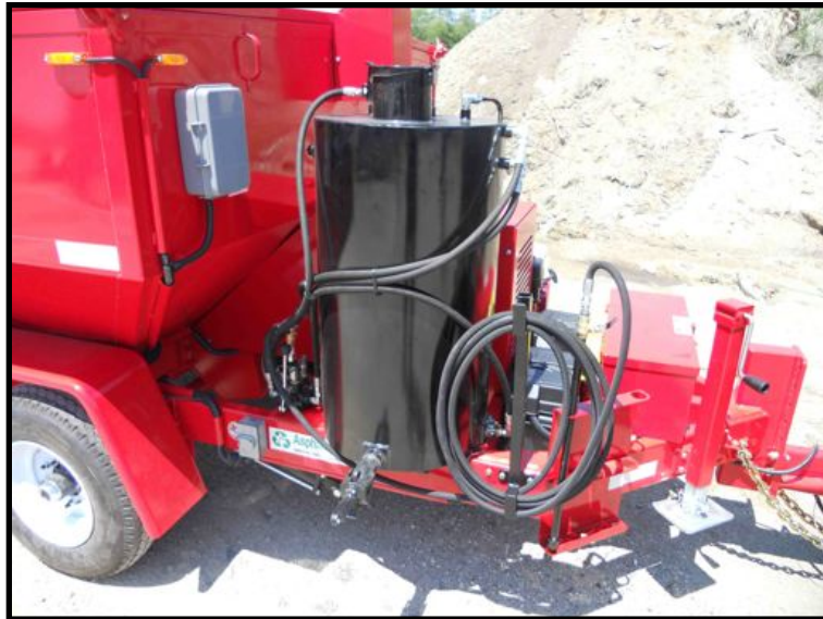
Holding Tank and Spray Wand