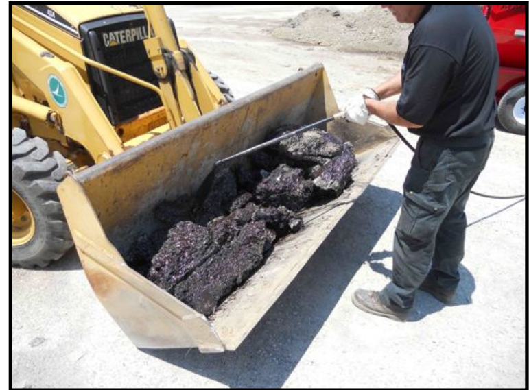
Coating Asphalt with Rejuvenator