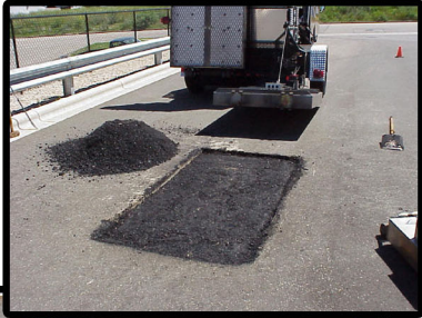
POTHOLE REPAIR AND PREVENTIVE MAINTENANCE